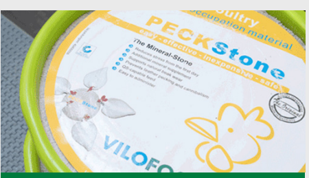
Unpack and select a location