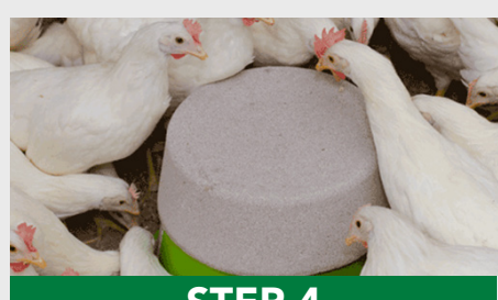
STEP 4 Step back and watch