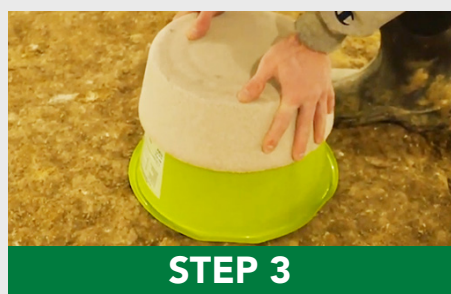
Place stone on top of tub