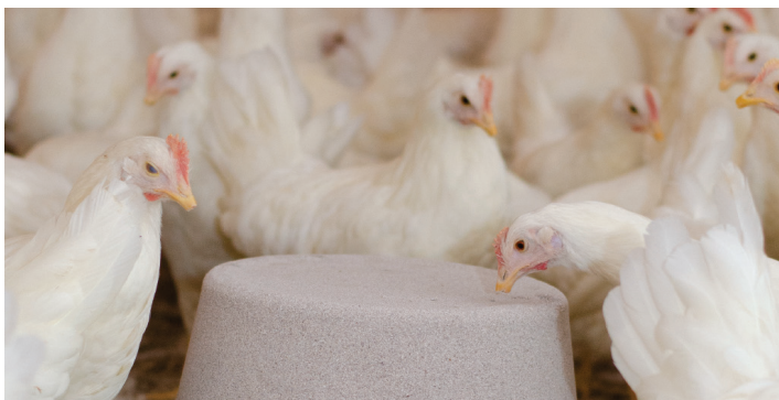
CAGE FREE LAYERS AND BREEDERS